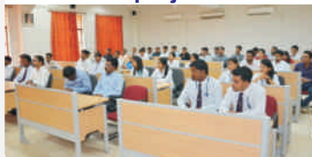
A.C. Classrooms with LCD projector