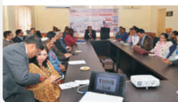
A.C. Conference Room