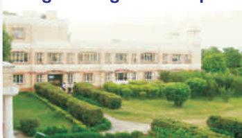
Huge lush green campus