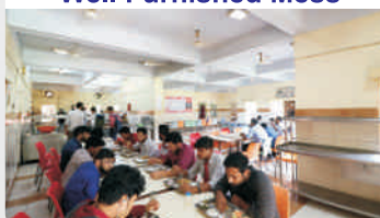
Well Furnished Mess