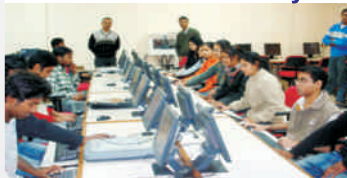
A.C. Computer lab with Internet facility